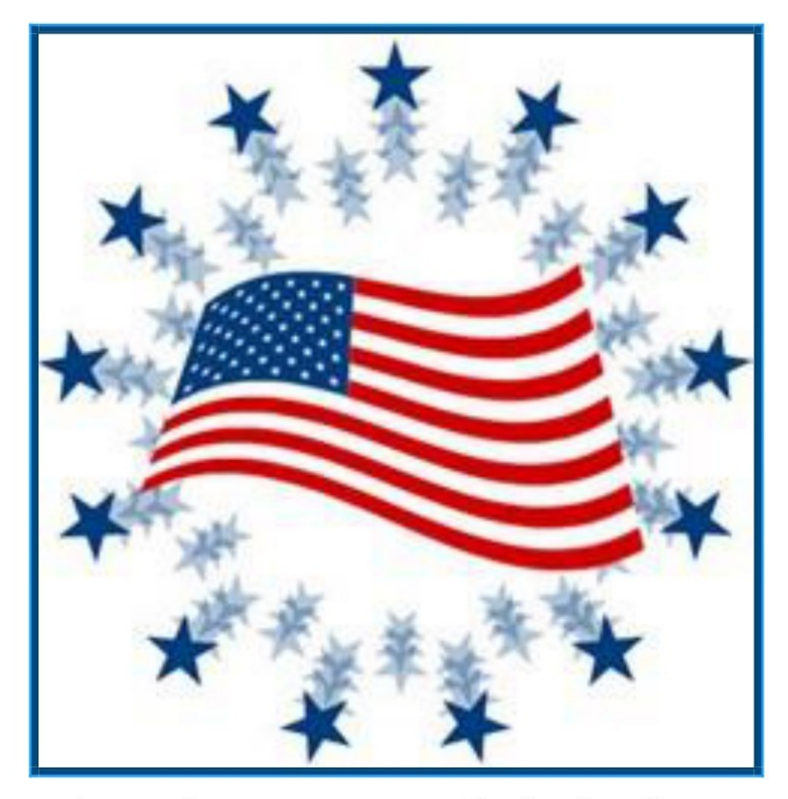
Join us for our Annual 4<sup>th</sup> of July BBQ American Legion Post 419 958 Homestead Rd Santa Clara, California 11:00 am to 3:00 pm